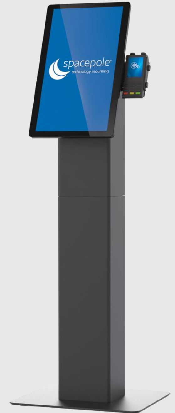
Floorstanding Kiosk without printer