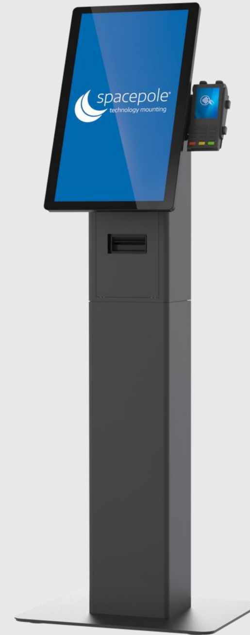
Floorstanding Kiosk with printer