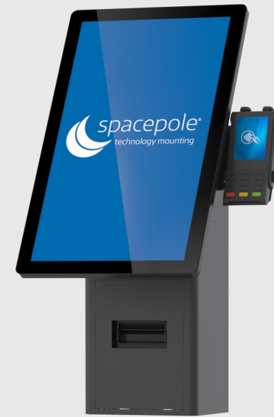
Wall Mounted Kiosk