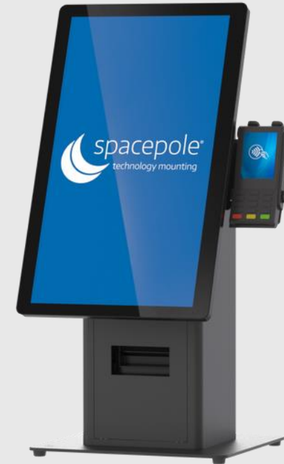
Counter Mounted Kiosk with printer