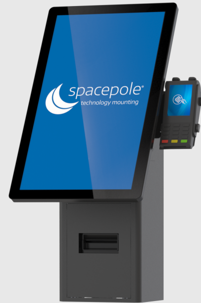
Wall Mounted Kiosk with printer