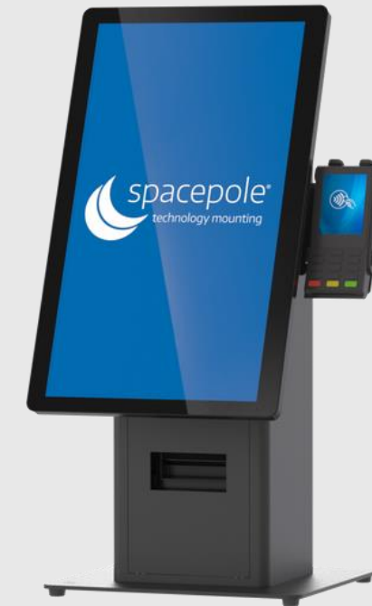
Counter Mounted Kiosk